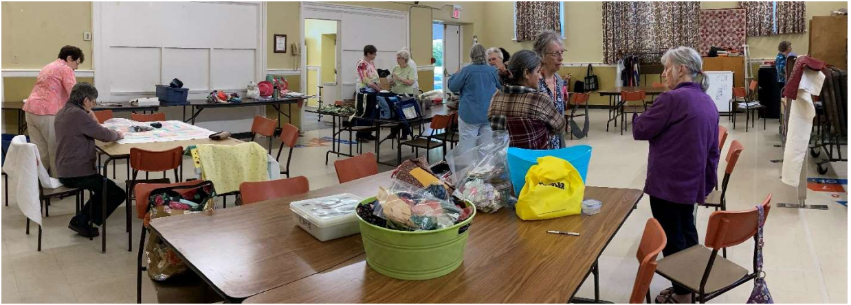
September 3 rd meeting