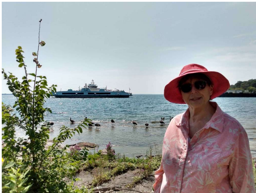
A summer retreat on the shores of Lake Ontario watching the Amherst Ferry sail by.