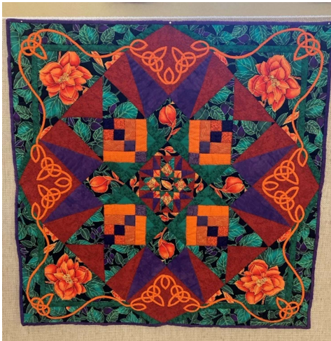
4 th place Yorkshire, pieced quilt