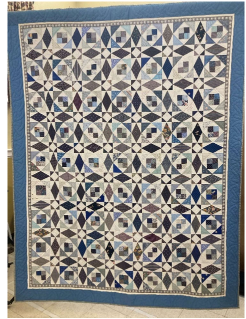
A Storm at Sea