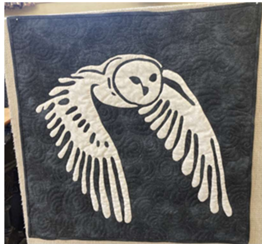
Applique wall hanging