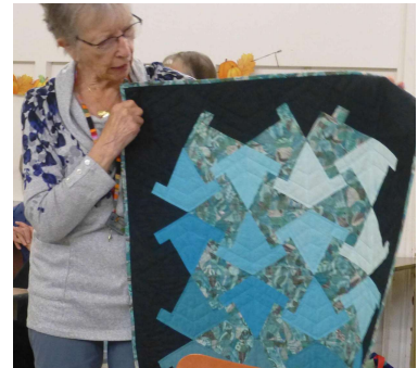
Art quilt 1 st Fall Fair 2019, challenge piece and Tessellation patterns. Hand quilted.